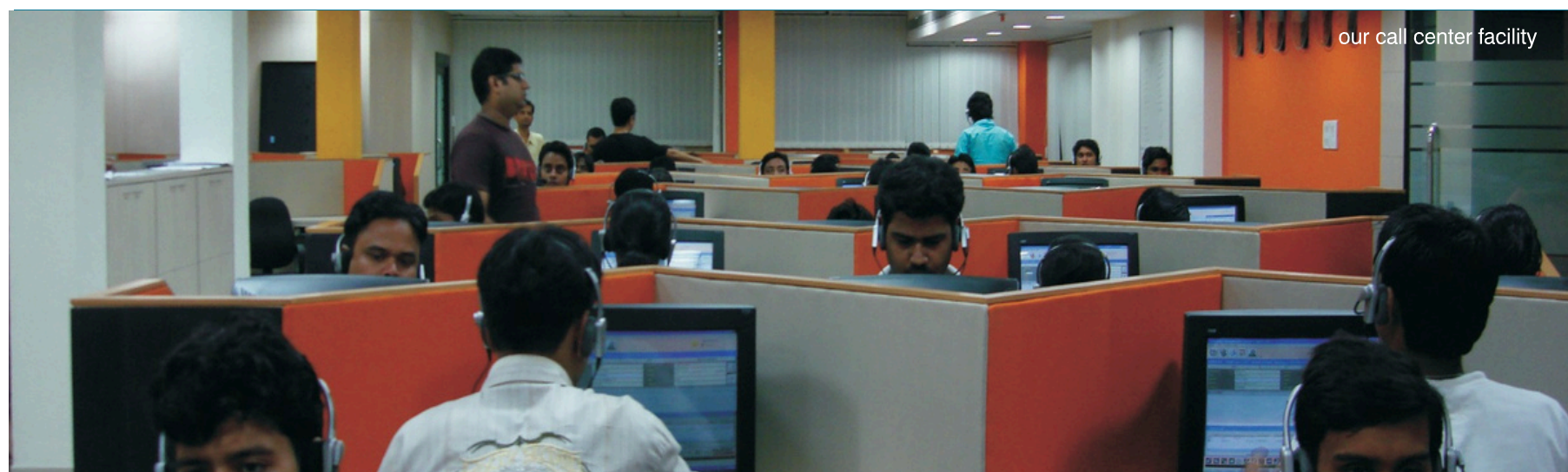
our call center facility

Corporate Presentation Application Software with VB, C, C++, JAVA, ASP.NET, SQL Server Data Mining & Internet Marketing Social Media, SEO and SEM Catalogue and Order Fulfilment